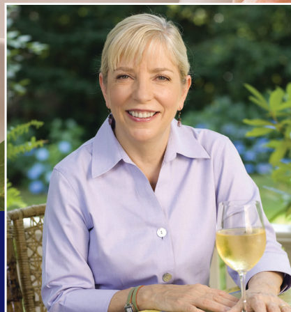
Sara Moulton PBS chef and cookbook author